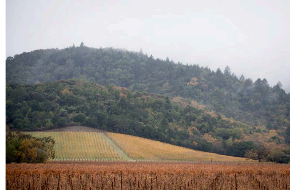
ABOVE: VINE HILL RANCH, OAKVILLE AVA BELOW: SLEEPING LADY VINEYARD, YOUNTVILLE AVA